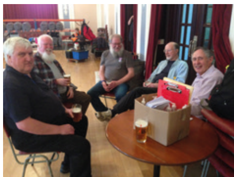
Tayside Branch volunteers enjoying a bit of 'down' time during 'set-up'

and dedication to the CAMRA cause. Meeting and greeting also meant being a local tourist guide. Strangest question asked on a few occasions related to the George Orwell on the pub trail. 'Is it a Wetherspoons?' It's not too unusual a question really when you consider that an Orwell fictional pub name has been used by Wetherspoons for their pub names in England.