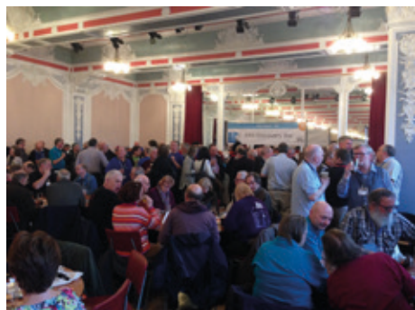
Members Bar in full swing

Duty started again on Friday with us local volunteers allocated front door duties to meet and greet our guests. At least the weather was kind for the queue ( above right ) forming across City Square ready for the 4pm opening and registration. Due to sufficient numbers of volunteers staffing the member's bar located in the Marriot Hall, no-one had to wait long to sample any of over 70 real ales and ciders showcasing some of the best of breweries in Scotland and Northern Ireland. That evening members also had the opportunity to go on either pre-booked brewery tours (Loch Leven, Inverarmad, St Andrews Brewing and 71 Brewing) or to venture out and visit some of Dundee's real ale pubs. Despite the best efforts of Scotrail with cancelled trains, many made it as far as Perth and Broughty Ferry. That included some gentlemen from the west who had substituted their usual Giraffe (Glasgow Real Ale Festival) gear for a Dennis the Menace tour of Broughty Ferry.